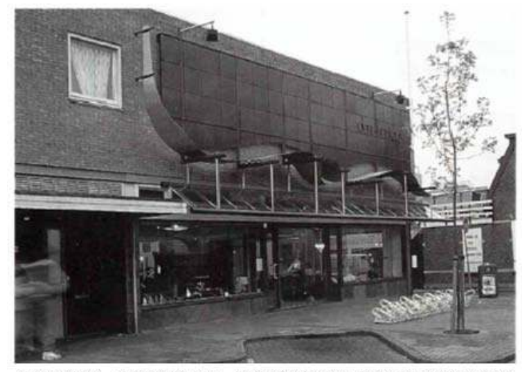
Awning shop – Alphen a/d Rijn – The Netherlands. The <u>currogated</u> parts are of stainless steel

All the values in the tables are indicators which give an average