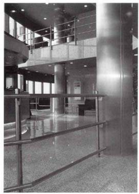
Europagebouw – Haarlem – The Netherlands Two stainless steel sheets are covering two concrete pollars

Molybdenum has the same effect on the structure as chrome has and mostly it increases the corrosion resistance both of ferritic and austenitic stainless steel. In some countries this