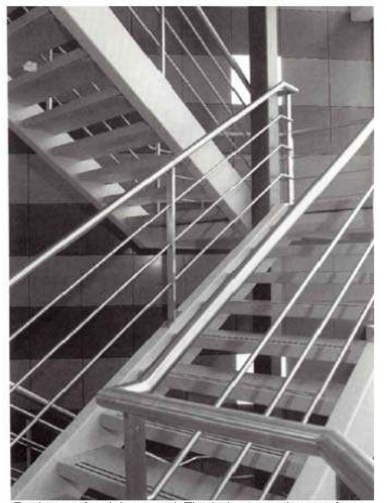
Banisters of stainless steel. The balusters exist out of two fixed flat bars welded at the innside.

Influence of chrome alloy During oxidation of steel the formed oxide coating (rust layer) takes a bigger volume than the mother material. The oxide product dilates, presses itself into parts and does not form anymore a unity with the underlying mother material: it is porous. This phenomenon does not occur, for example, with aluminum and chrome, so that corrosion products stay intact on these materials. A chromed handlebar is a good example of this: thanks to the perfect fitting