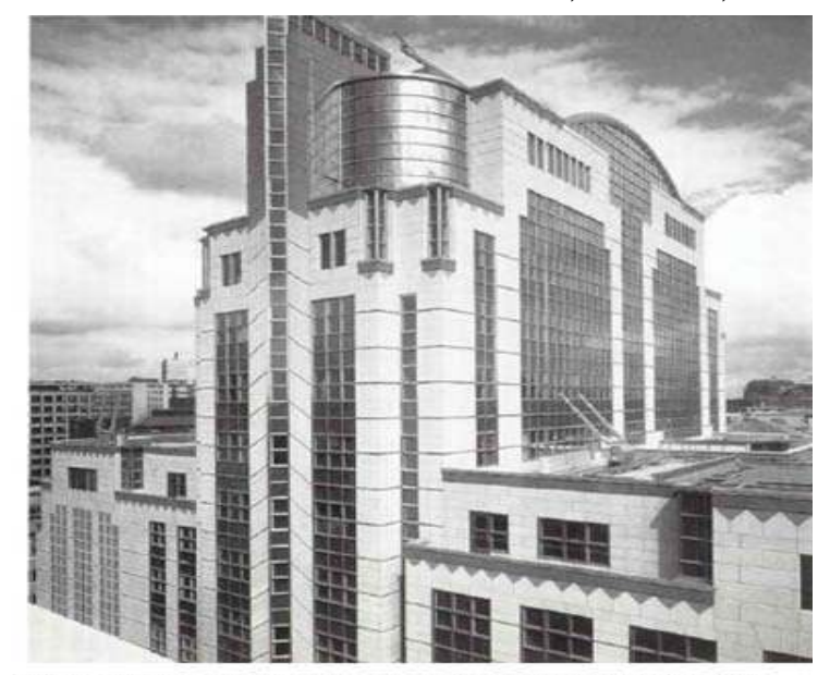
One American Square Tower, London. In this project stainless steel is used as curtain wall at the top of the building (AISI 316), for the fixing of the granite (AISI 304) and the snap-in-construction (AISI 316)

All not amalgamated or little amalgamated types of steel have in common that they react with oxygen in presence of an electrolyte. (An electrolyte is a substance, like water, whose