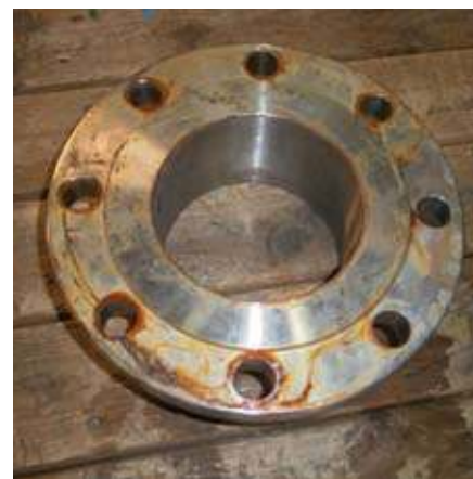
Fig. 5. RVS 304 flange contaminated by ferruginous water.

Various maintenance advice can be found on the Internet regarding stainless steel. Unfortunately, reputable companies sometimes issue advice that is often at odds with what should actually be done. For example, advice is given to clean contaminated stainless steel with steel wool or a scouring sponge. This should particularly be avoided as steel wool is something that contaminates stainless steel and a scouring sponge damages the surface. This is why Innosoft B570 is a product that only dissolves the iron oxides and also has a deep cleansing effect. In other words, it is gentle on stainless steel but tough on oxides and all kinds of dirt. A good example can be seen in Figs. 5 and 6. A stainless steel flange 304 was kept in a plastic bag in which ferruginous water was present. The flange came out the packaging in such a state that it was ready for the scrapheap. This problem was easy to solve with the afore-mentioned organic cleaner and the flange was recondi-