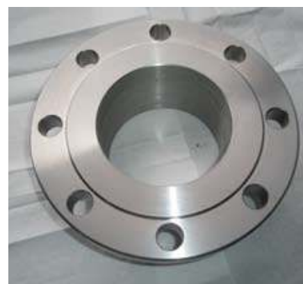
Fig. 6. The same flange as in Figure 5 but cleaned with Innosoft B570 and coated with a nanolayer.