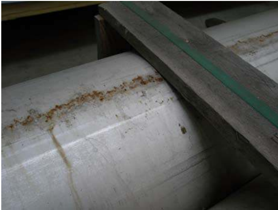
Fig. 7. Stainless steel 316 tube that was badly contaminated by steel grit on a building site.