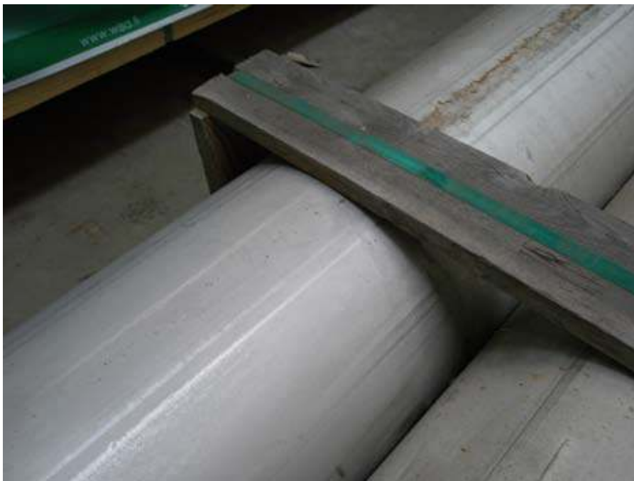
Fig. 8. The same tube as in Fig. 7 but cleaned on the left side of the bar.

devastating work, whilst oxygen is scarcely able or unable to reach this particular surface to maintain its passivity. InnoSoft B570 penetrates deep down into the pores, however, in order to remove these harmful dirt deposits. This is why this product also acts as a detergent, and dirt and micro-organisms in so-called 'hidden pockets' (that can be found in the surface) are also likely to disappear.