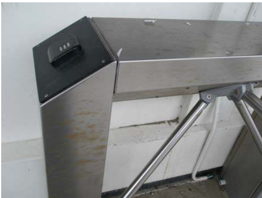
Fig. 2. RVS 316 access gate corroded by aerosols.

Local rust spots can also develop due to aerosols, for example, and this primarily occurs in coastal areas. Aerosols are small droplets of seawater that are carried from the sea by the wind and which evaporate during their flight leading to a further increase in salt and chloride concentrations. This forms a greater corrosive load for stainless steel than normal seawater. The result is local corrosion that can also even lead to pitting corrosion at times. The effect of this action can regularly be seen on stainless steel parts on or near the shore in particular. In Fig. 2 you can