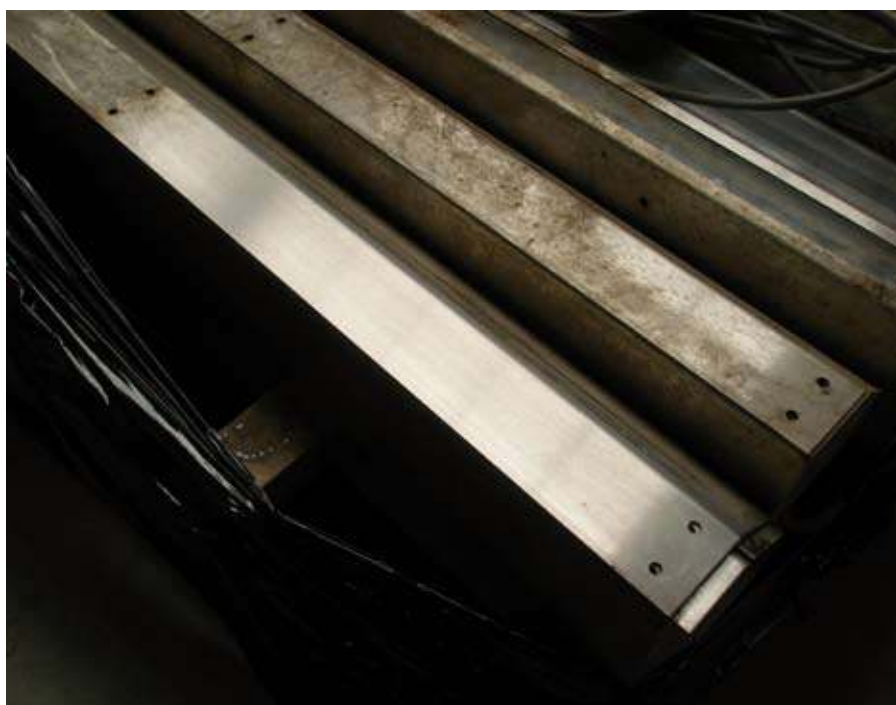
Fig. 4. Contamination corrosion on 316L light fittings (the bottom fitting has partially been treated with the organic acid Innosoft B570).

Local rust formation can be removed with pickling liquids or pickling pastes as well as with inorganic chemicals. In some cases this can also be done mechanically with, for example, sandpaper, special scourers or stainless steel brushes. The disadvantages are generally well-known, as scouring damages the surface considerably and, in addition, the scoured area is often less corrosion-resistant. Pickling is harmful to the environment and dangerous for the people working with it. Regular inhalation of the hydrogen fluoride present can even lead to a pulmonary embolism. The use of inorganic acids also has its dangers and is also subject to stringent rules and guidelines. This is why an oxide-dissolving organic agent called Innosoft B570 is now available that gives a very effective and efficient result. In Fig. 4 you can see light fittings made from stainless steel 316 that were only in use in a maritime environment for one and a half years. The top sections still show the severity of this contamination by aerosols. After use of the organic acid Innosoft B570, the surface was quickly restored to its original condition. The bottom fitting has partially been treated with this. And yet one must not lose sight of the fact that small scars may have developed in the surface that could quickly lead to new corrosion as soon as the fit-