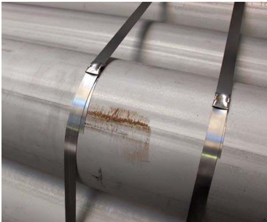
Fig. 3. Contamination by a steel object such as the fork of a forklift truck.

see an access gate made from stainless steel 316 that is situated near to the coast. Rust spots, which in this case are also known as tea stains, can clearly be seen.