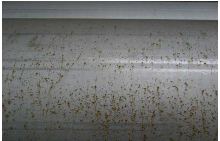
Fig. 1. contamination corrosion on stainless steel tubes caused by carbon steel grinding.

One of the causes of flash rust, also known as rust film, is when small steel particles fall or swirl down onto a stainless steel surface. When combined with moisture, they quickly dissolve due to the base character of the steel particles (see Fig. 1). There is a relatively large potential difference between stainless steel and carbon steel, which is why this reaction occurs extremely quickly. In practice, the term 'iron particles' is often used, but what is actually meant is 'steel particles'. During dissolution of the steel particles, iron oxides are created that contaminate the surface of the stainless steel. In addition, oxygen is somewhat prevented from entering the area, as a result of which the stain-