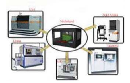
Fig. 3: Schematic representation of Digital Transfer Parts. Printers, wherever in the world, are operated by a server.

The maintainability of the whole is taken into account so that no illegal copies of the products can be made. Such services can usually be sent through the cloud. This system is also protected against the usage of incorrect materials, whereby one can ultimately issue a certificate for the created product.