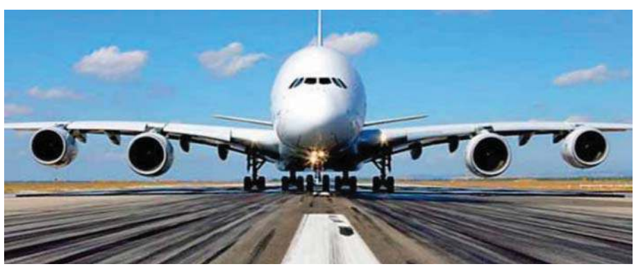
Fig. 4. An airbus A380. of the 140 tons of titanium required, approximately 90% is chipped.

effect. In addition, keeping spare parts and components in stock can be forgotten for the most part, as with this technique, one can produce parts quickly according to the requirements of the customer. Even a broken part can be glued and scanned, and materialised again if this is permissible with the owner.