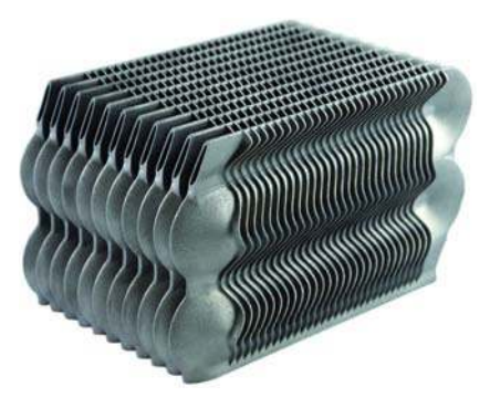
Fig. 2. RVS 316 heat exchanger, which has been printed in 3D.

Another big advantage, is that one has unlimited freedom in the geometry of the product, both internally and externally. One can even apply cooling channels, which can be spiral shaped. In Fig. 2, you can see a stainless steel heat exchanger, which has been 3D printed.