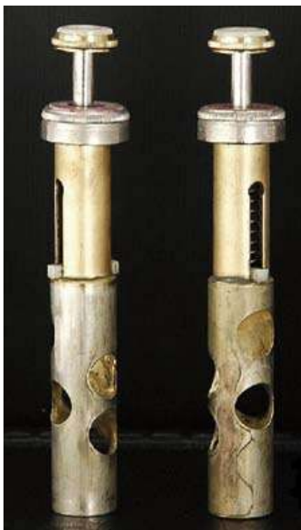
Monel 400 pistons (Getzen)

It is generally known that nickel is used in iron and copper alloys. How-