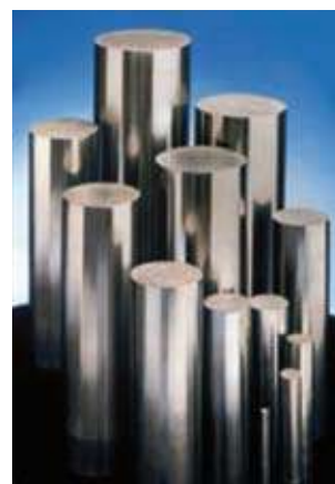
Nickel 201 bar material

been replaced by 10% or more of molybdenum and about 1% of nickel. This gives us an alloy called titanium grade 12, which has a considerably higher resistance to crevice corrosion than grade 2 in seawater that is hotter than 80°C, but whose performance does not come up to that of grade 7.