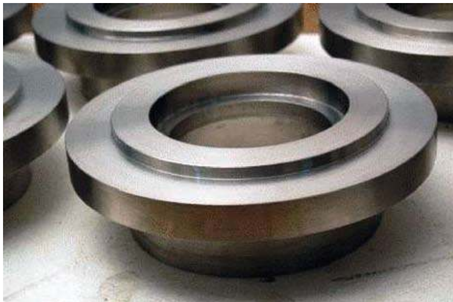
Hastelloy heat exchanger

an alloying element, and it is found regularly in stainless steel copper alloys. It can also be found as an alloying element in titanium. A summary of the effects of nickel on these materials is given below.