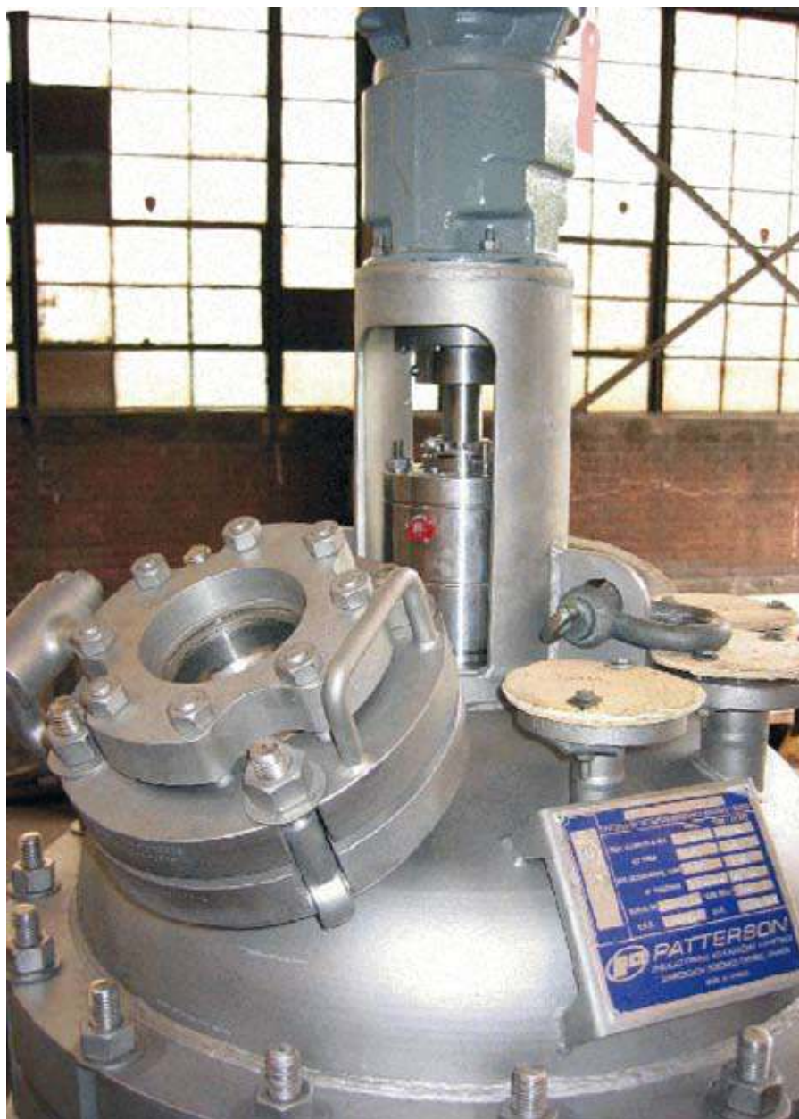
Hastelloy reactor (Patterson)

rings and valves. In the chemicals industry too the alloy finds a use in the preparation of all kinds of chemicals and for salt preparation. Among its applications in shipping are valves, fire extinguishing equipment, pumps and propeller shafts. Power generation technology uses the alloy in piping systems and heat exchangers. Recently the metal has been used successfully in environmental technology, in evaporators and waste water crystallisers. Nickel alloy 400 can be hot- or cold-worked. During forging a temperature between 930°C and 1160°C is maintained, while hot bending is carried out between temperatures of 1000°C and 1180°C. After cold working of more than 5%, stress relief annealing is necessary. This annealing treatment is also strongly to be recommended after hot working. The oven atmosphere