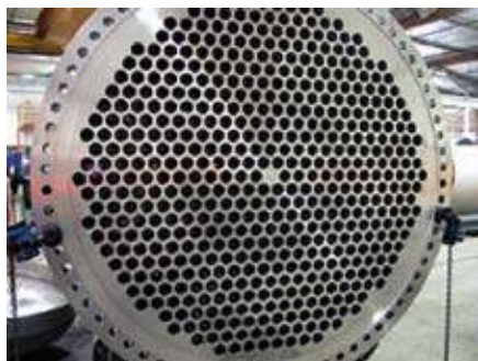
Hastelloy heat exchanger

Alloy 400, which is known as "Monel 400" and by other names, is found especially in offshore applications such as condensers, piping systems, plate